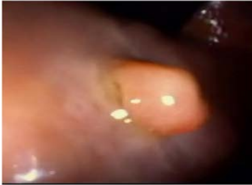
Figure 1: Endoscopic image of the rectal polyp.

The pinkish growth had a smooth surface with visible dilated blood vessels. The mass was removed whole with a cold snare biopsy forceps. Histopathologic report of the tissue showed submucosal populations of spindle cell