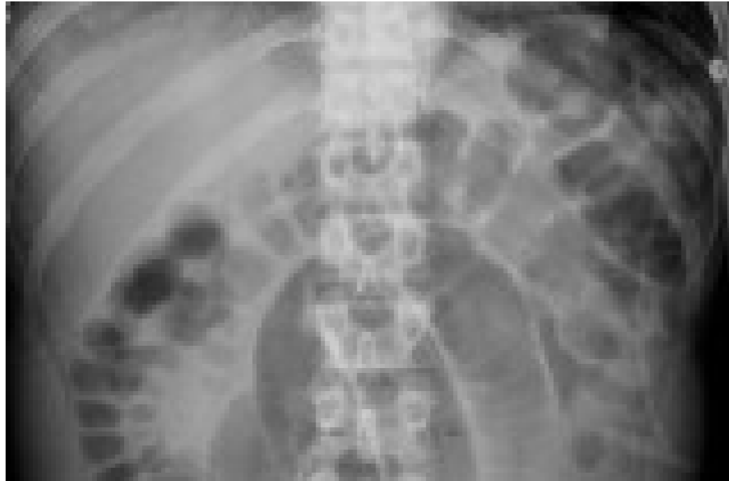
Figure 2: Preoperative A-P abdominal X-ray in erect position showing small distension

tric tube and urethral catheterization to monitor urine output. A Full blood count, urinalysis, HIV screening, electrolytes, urea and creatinine, and plain abdominal x-rays in erect and supine positions were requested. The results of the investigations showed: a haemoglobin of 12.8g/dl, white cell count of 10.2 \times 10^9/L ; and distended loops of small bowel [Figure.2].