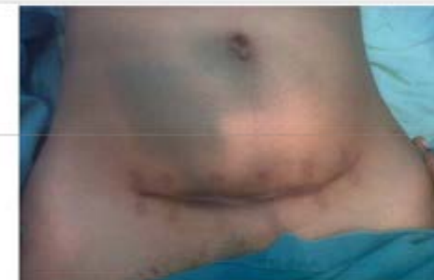
Figure 1 :Preoperative lower abdominal distension

Figure 1: Preoperative Photograph showing lower abdominal distension and a recent Pfannestiel incision