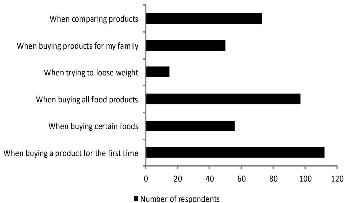
Figure 2: Bar graph indicating when respondents read food labels

Fewer respondents read labels when comparing products (18%), when buying certain food products (13.8%), when purchasing food for the family (12.4%), and when observing specific diet to lose weight (3.7%).