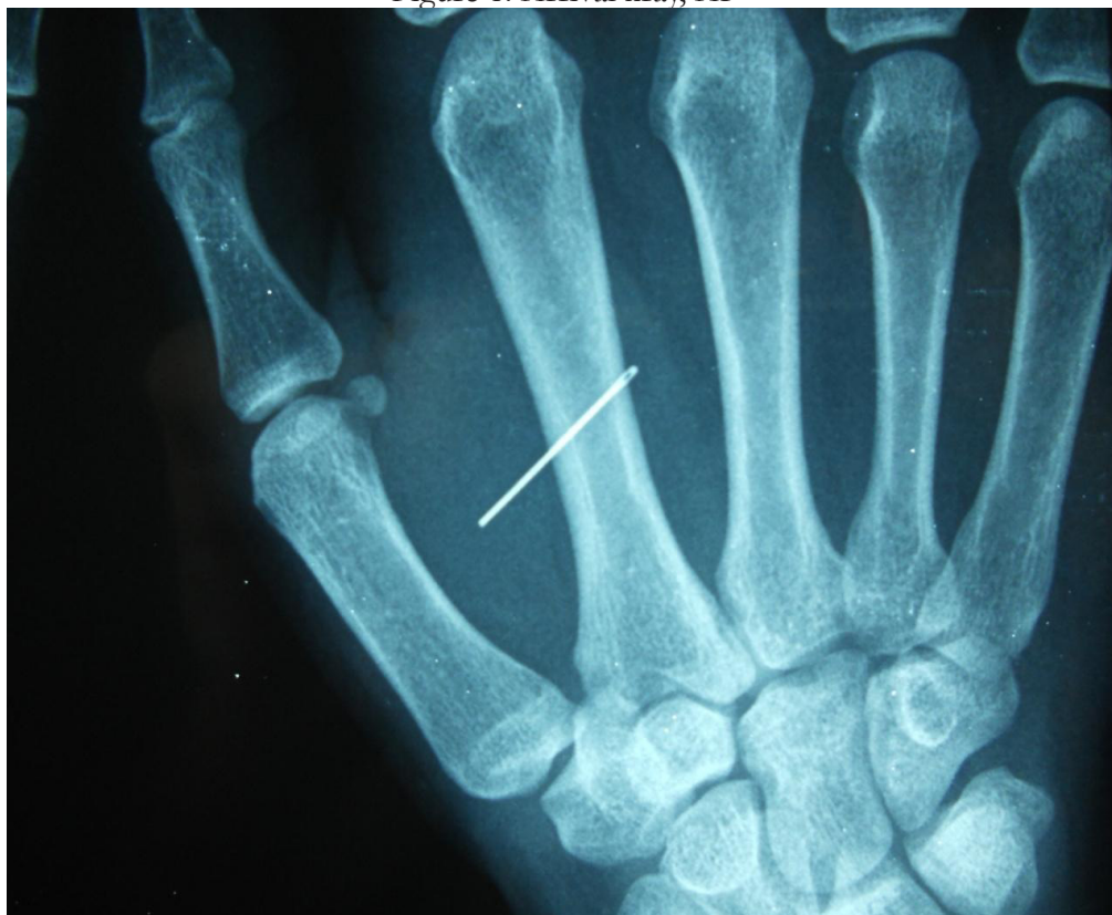
Figure 1. Arrival xray, AP

In all patients, by looking anteroposterior(AP) X-ray and taking consideration the entrance hole of foreign body the possible place of the needle was determined (Figure 1).