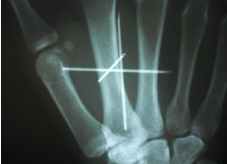
Figure 4. The control graphy AP

In the lateral graphy, the distance and orientation of the foreign body away from the skin was assessed (Figure 5).