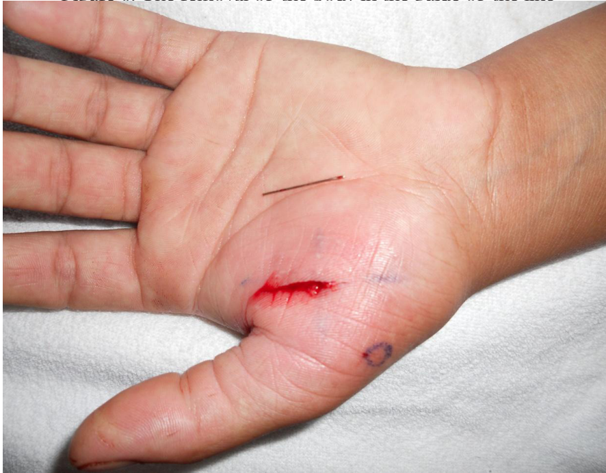
Figure 6. The removal of the body in the guide of the line

The incisions after the necessary washing and debridement were appropriately sutured.