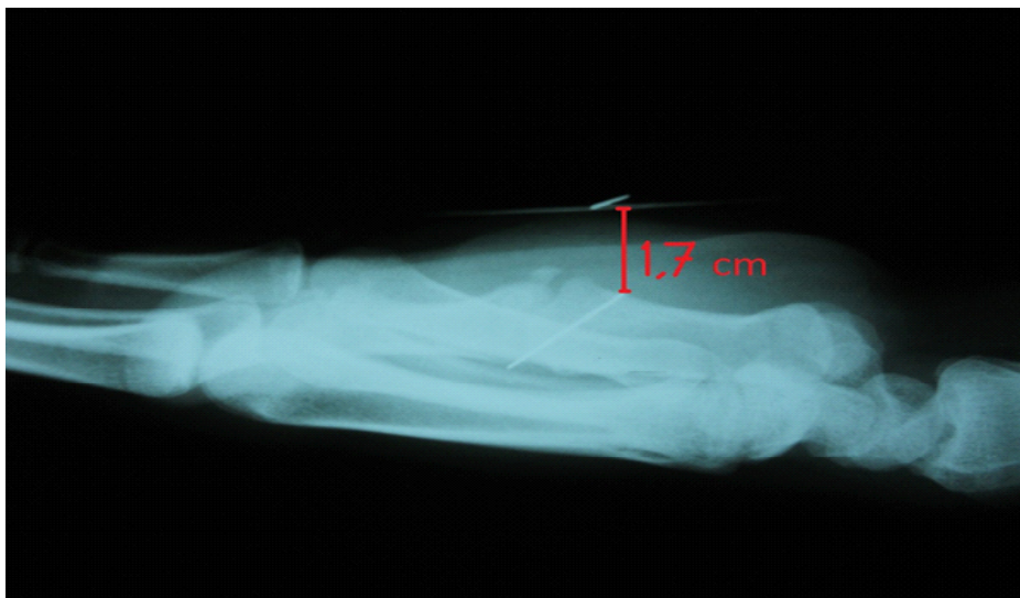
Figure 5. The control graphy lateral (1.7cm away from the skin)

Then the injection tips were removed and under the guidance of marking lines, the skin and subcutaneous incision was made by taking into consideration the distance of the foreign body away from the skin and