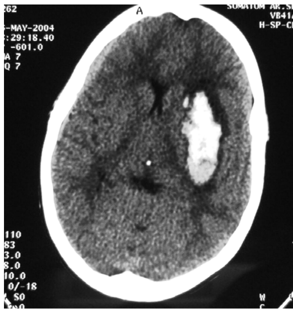
Fig.2: Brain CT scan showing acute intra-cerebral haematoma