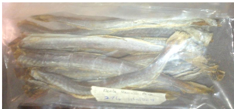
Figure 3 : Sample of stockfish Produced.

R is the drying rate in g/hr, dM is the change in mass (g), dt is the change in time (hr) and t is the total time (hr). m_i and m_f are the initial and final mass of fish samples respectively in gram.