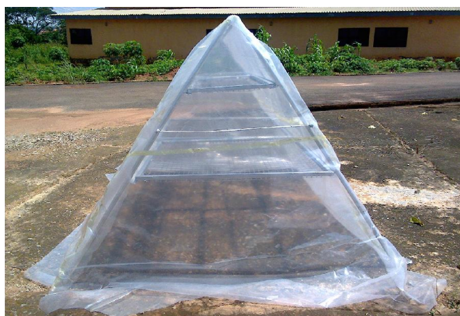
Figure 1 : Pictorial view of the solar tent dryer.

A solar tent dryer was developed for the purpose of the study. The dryer has capacity to hold 25 kg fresh fish per batch. It was mainly fabricated of steel and polythene sheet. The tent dryer has dimension of 245 x 184 x 160 cm (L x B x H). The frame was constructed of galvanized pipe of 2.54 cm diameter while the rack was made of 37.5 x 37.5 mm angle iron. The dryer has two sets of trays with an interspacing of 82.5 cm. The first sets has two (2) trays of dimension 120 x 109 cm situated 77 cm from the floor while the second set consists of two trays of dimension 120 x 45 cm positioned 42 cm from the top of the dryer. The frame was covered with 0.25 mm thick polyethylene sheet. It is collapsible for ease and comfort of transportation. Openings which are underlay with a thin pvc mesh (mosquito nets) were provided at the base end for fresh air intake and at the angular top sides of the dryer for moisture laden air exit. The pictorial view of the dryer is presented as Figure 1.