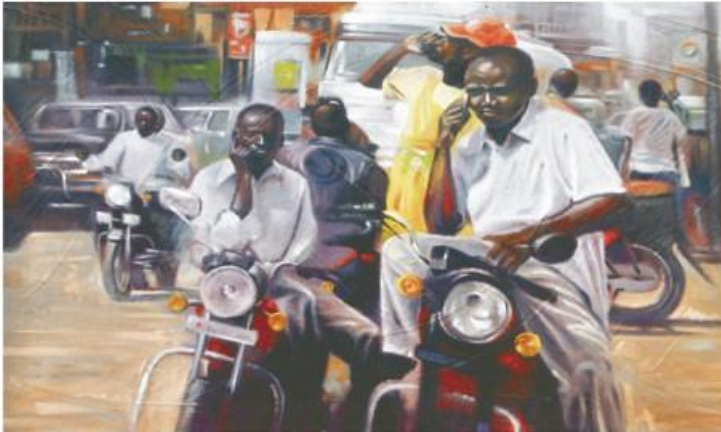
Fig. 10. Assembly of Network (Oil on Canvas)