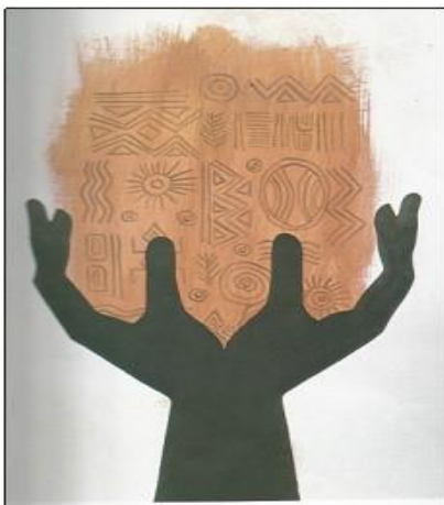
Fig. 4. Haig David-West's Protect Our Culture

Also, Haig David-West's Protect Our Culture (Fig. 4), depicts an image of two black and open hands carrying a painting with symbols and motifs of the African culture which represents unity or oneness (Chukueggu, 1998, pp. 126-127).