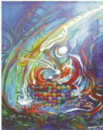
Fig. 16. Remember Oil Flow I 2014 (Mixed Media Painting) Artist: Nics O. Ubogu

Nics Onataghogho Ubogu is a contemporary African artist who draws inspiration from everyday events in the socio-cultural, economic and political life of the Nigerian Society, and employs a variety of media and techniques in the creation of his art. Ubogu is a lecturer in Fine Arts and Design at the University of Port Harcourt. The artist is highly interested in painting pictures in abstraction which is evident in his artwork titled Remember Oil Flow I, II and III (Figs. 16, 17 and 18). Remember Oil Flow I (Fig. 16) is a painting in abstract showing lines and circular forms. The movement of blue, yellow and red lines represents oil flow on the earth's surface. Also, there is a concentration of round objects in different colours at the bottom of the mixed media painting which represent the different attributes of the oil. Remember Oil Flow II (Fig. 17) represents the flame of the burning crude oil. At the bottom part of the acrylic painting, the "black gold" is represented in black hues of red and the upper part of the painting is a blue, red and yellowish flame. In Remember Oil Flow III (Fig. 18), the colours are prussian blue black and reddish brown on strawboard. The movement of oil is highly concentrated in the middle of the painting.