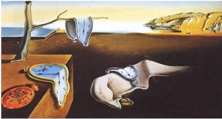
Fig. 1. Salvador Dali's The Persistence of Memory 1931 Oil on Canvas, 9 ½ x 13 in.

Another intriguing visual metaphor is Ilya Glazunov's The Last Leaf (Fig. 2) which portrays an image of an empty birdcage hanging on a tree with a lone leaf. Beside the tree is an image of a sick man while a bust stand on the window sill. This painting is a visual metaphor for "life vs. death, eternal vs. temporal" (Petrenko & Korotchenko, 2012, p. 540).