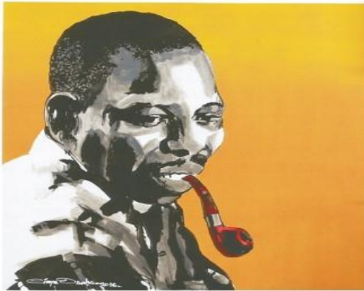
Fig. 7. Remember Ken Saro-Wiwa (Acrylic on Canvas) Artist: Diseye Tantua

One major work art created by him is the portrait of the iconic fallen hero, Kenule Saro-Wiwa, popularly called Ken Saro-Wiwa, the leader of the 'Ogoni Nine'.