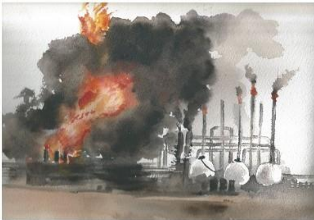
Fig. 15. Explosion III Refinery (Water Colour) 2018 Artist: Kingsley Gomka

The artist's paintings signify some visual elements that are hard to forget - burning flames of oil, polluted waters and the desolate people and environment. Secondly, the fishermen paddling their boat and watching the explosion reflect the helplessness of the people in the face of such calamities which destroy the aquatic life that is their means of sustenance, and impact their health negatively. Mostly, it is a metaphor of the hopelessness of their situation.