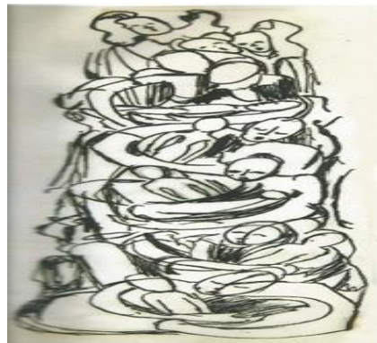
Fig. 5. Statue of Freedom (Ogoni Nine) (2002) Watercolor Study (118x83cm) Artist: Bruce Onobrakeya