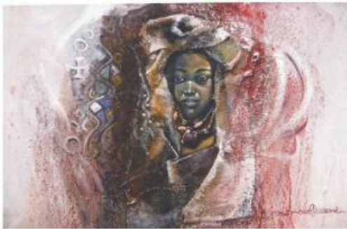
Fig. 3. Hello (Revealing a New Self), 2009 Oil on Mixed Media, 61 cm x 91.5