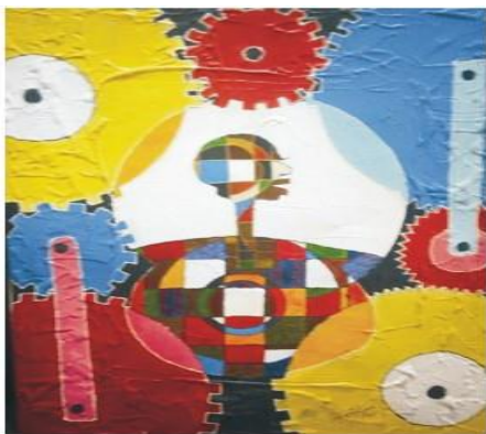
Fig. 11. Oil Wheel

Aduche Iche-Okoro is a graduate of the Rivers State College of Education (now Ignatius Ajuru University of Education) and the Department of Fine Arts and Design, University of Port Harcourt. His painting titled Oil Wheel (Fig. 11) is a mixed media painting created in brilliant, basic primary colours with an abstract figure in the middle of picture. The figures are mechanical rotary wheels in the oil production sector, either in crude or palm oil production. As a visual metaphor, it emphasizes the economic impact of oil production on man.