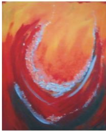
Fig. 17. Remember Oil Flow II 2014 (Acrylic) Artist: Nics O. Ubogu