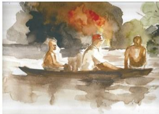
Fig. 14. Explosion II (Water Colour) 2018 Artist: Kingsley Gomka