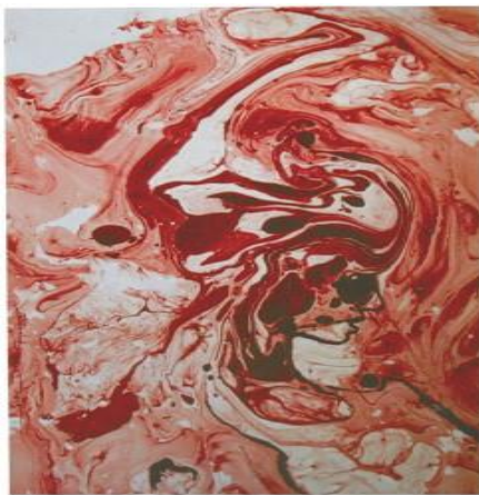
Fig. 12. Circle of Life, 2015 (Print Making) Artist: Etido Effiong Inyang

Printmaking describes a variety of techniques developed to create multiple copies of single images (Frank, 2006, p. 127). Inyang's work, titled Circle of Life (Fig. 12), which portrays the movement and flow of colours can be interpreted as the flow of crude oil as a blessing to the Nigerian economy.