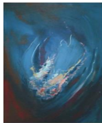
Fig. 18. Remember Oil Flow III 2014 (Acrylic) Artist: Nics O. Ubogu

According to Ugiomoh (2014), "While we cannot all be artists, the artist's synthesizing will, which an encounter with reality allows remain our very close companions in the constructed metaphor. A metaphor, as sign bearer, thus instructs and informs and will always demand our attention" (p. 3). This observation is valid and finds substance in Ubogu's symbolization of the importance of crude oil revenue in the development of the nation and host communities. When properly managed, it adds to the improvement of the standard of living within the host communities through the development of facilities such as roads, schools, hospitals, clean water facilities, and electricity.