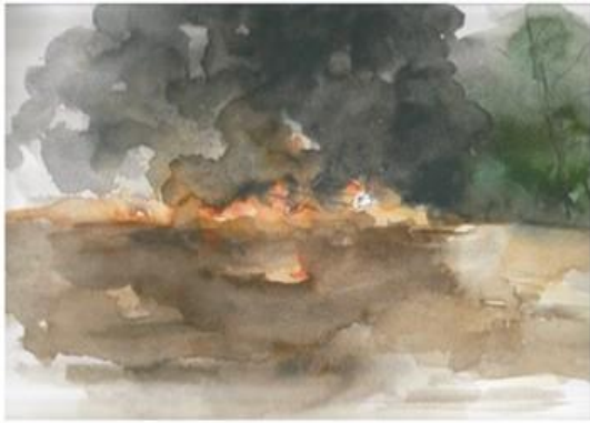
Fig. 13. Explosion I (Water Colour) 2018 Artist: Kingsley Gomka