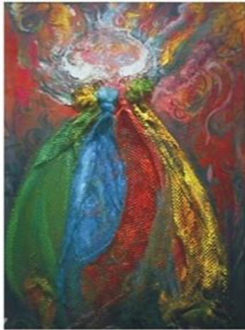
Fig. 19. Fishing Net in Crude Oil 2014 (Mixed Media Painting) Artist: Nics O. Ubogu

message of this visual metaphor is that oil pollution has destroyed aquatic life. It is a visual metaphor of protest.