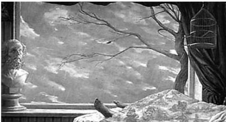
Fig. 2. Ilya Glazunov's The Last Leaf

Another intriguing visual metaphor is Ilya Glazunov's The Last Leaf (Fig. 2) which portrays an image of an empty birdcage hanging on a tree with a lone leaf. Beside the tree is an image of a sick man while a bust stand on the window sill. This painting is a visual metaphor for "life vs. death, eternal vs. temporal" (Petrenko & Korotchenko, 2012, p. 540).