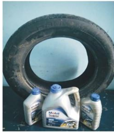
Fig. 20. Oil Byproduct 2018 (Installation) Artist: Nics O. Ubogu

Oil Byproduct (Installation; 2014), however, is an installation art consisting of refined products of crude oil used to service the engine of vehicles. The idea of using a vehicle tyre as part of the artwork is a natural means of creative expression in visual metaphor. The artistic composition is a reminder of the positive aspects of oil exploration.