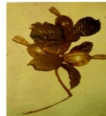
Plate 6 Fruit of uli okorobiam

Location: Nimo Date: 2013