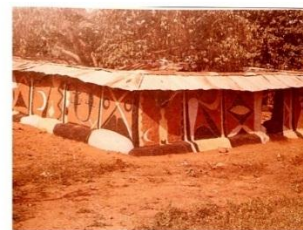
Plate 12 Mural on a shrine wall

Location: Nsugbe Date: 1983