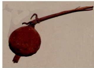
Plate 5 Fruit of uli ede-eji

Location: Nimo Date: 2013