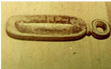
Plate 7 Okwa uli (Uli dye container)

Location: Nimo Date: 2013