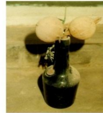
Plate 3 Fruit of uli oba

Location: Umuagana Date: 1983