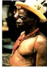
Plate 2 An adult decorated with uli designs

Location: Awka Date: 1982