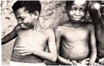
Plate 1 Children adorned with uli designs

Location: Awka Date: 1982