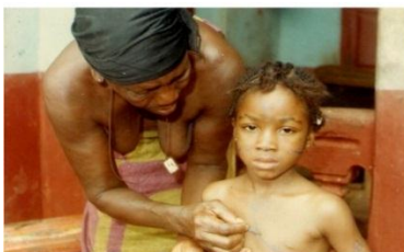
Plate 10 A little girl decorated with uli akala (line) motif which signifies long life

Location: Nimo Date: 2013