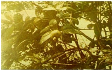
Plate 4 Fruit of uli nkilisi

Location: Nimo Date: 2013