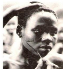
Plate 8 Mkpisi uli used for body decoration

Location: Ukpo Date: 2013