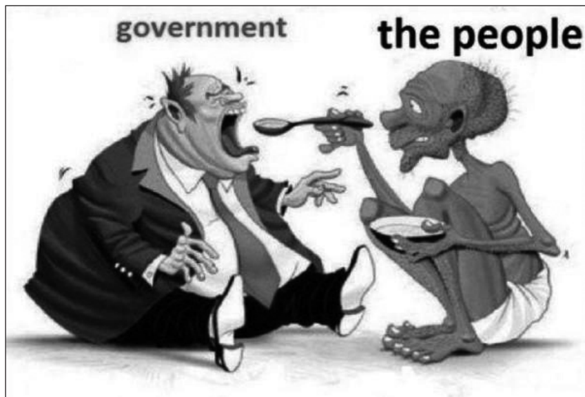
Figure 3: People feeding government