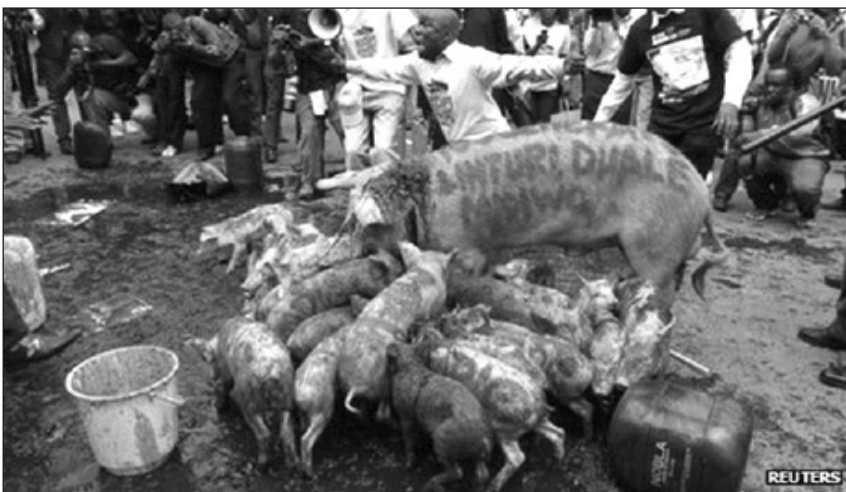
Figure 4: Artists release pigs and piglets, all drenched in blood

The ultimate in the ‘Occupy Parliament’ movement protests was when the protestors released a lorry-load of pigs with several piglets in the main entrance of Parliament (see Figure 4). Each pig and piglet had a human name smeared on its body skin representing a greedy MP. The father pig – the gender was apparently evident – representing a patriarchal parliament, presided by a patriarchal Speaker, as an independent institution remained condemned for allowing a sponsored motion seeking a pay hike for its piglets (individual MPs). Parliament’s reputation as the home of dignity had been replaced as a den of filthy politics with greedy legislators. The pigs were drenched with several gallons of blood. The pigs started licking the blood oblivious of what was happening around them. Since their mission in life is to eat and fatten, no matter the state of affairs, they remained focused on the blood and stuck to that, rather than deliberating, as MPs, on crucial issues in Parliament’. This was symbolic of the gluttony of MPs who were robbing ordinary Kenyans without due regard and/or care. The greedy legislators were riding roughshod over the wishes of Kenyans in order to continue looting and plundering the economy.