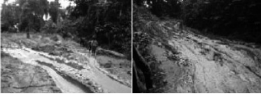
Figure 3: Poor nature of the roads during the rainy season connecting Kumba-Mbonge (a) and Kumba-Ikiliwindi (b)