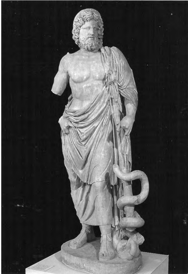
Figure 28: Asclepius with staff and single snake. Epidaurus Museum.

Podaleiros and Machaon. Jayne (1925:248-9), however, is of the opinion that the information about his sons was added to the main text at a much later date. Machaon received the gift of surgery, while Podaleiros received the knowledge to diagnose and cure hidden and desperate illnesses. A third son, Telesphorus, always depicted as child, was commonly shown in art (Jayne 1925:248-9; Rose 1979:1041).