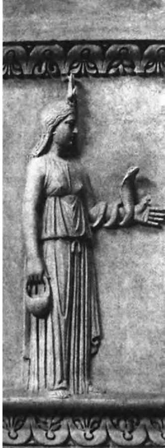
Figure 13: A priestess of Isis, dressed as the goddess with a cobra around her left arm.

Rome. An image of Cleopatra was displayed in the procession, wearing the robes of Isis and with the goddess's traditional armband (a coiled snake) on her forearm (Fig. 13). Roman spectators ignorant of Egyptian religious symbolism might have interpreted this as suggesting that her death had been caused by a snake — in fact, three Roman poets