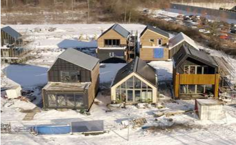
Figure 7: De Stripmaker, Almere, built using Wikihouse panels