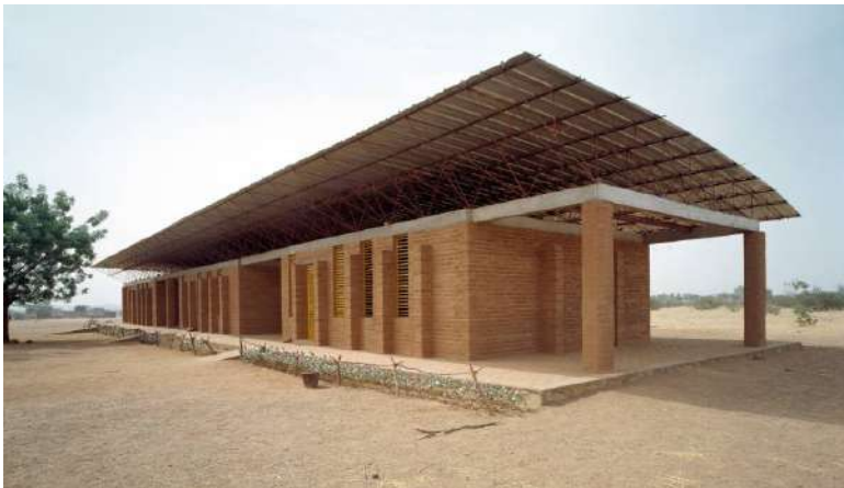
Figure 10: Gando Primary School.