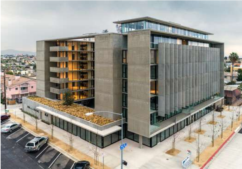
Figure 8: Park and Polk, San Diego (2018).