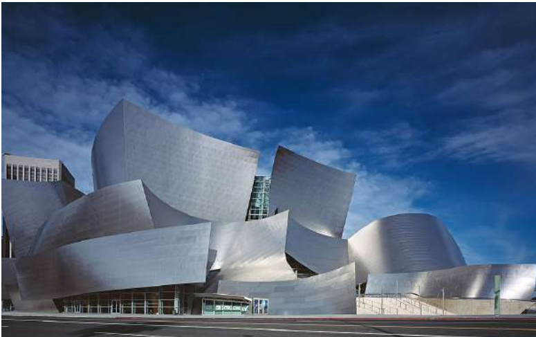
Figure 2: Walt Disney Concert Hall in Los Angeles (2003)

Frank Gehry established his practice in Los Angeles, California, in 1962 (Gehry Partners LLP, [n.d.]). Gehry's work is renowned for his incorporation of complex shapes such as those used in his Walt Disney Concert Hall (see Figure 2). The firm is regarded as one of the most influential practices of our day and Gehry is viewed by some as the world's most famous living architect (Architect, 2014).