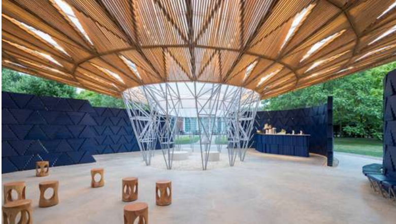
Figure 9: Ziba Stools at the Serpentine Pavilion.

construction of a primary school in Gando, Burkina Faso (see Figure 10) (Awan et al., 2011: 161).