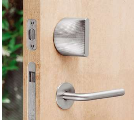
Figure 4: Friday Smart Lock

Other products include light fittings, furniture, accessories, porcelain ware, bathroom ware, cycling accessories, and vases (BIG ideas, [n.d.]). These items can be ordered online from its website.