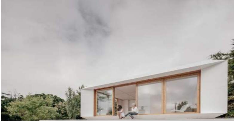
Figure 5: MIMA House (Vienna)