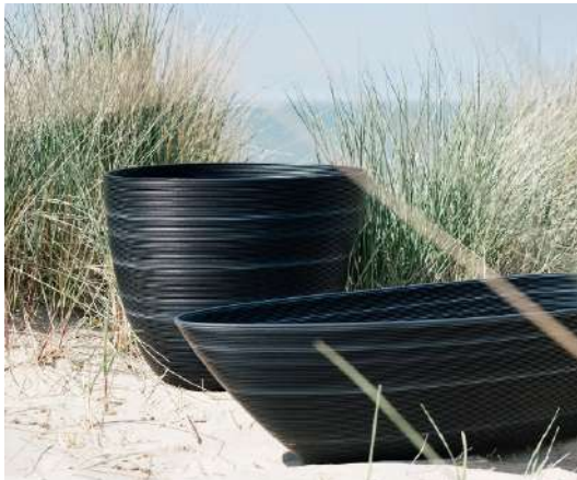
Figure 13: 3D-printed planters designed by House of DUS

Aectual allows designers to produce bespoke designs at any scale for any building. The firm produces personal and architectural products with their large-scale, three-dimensional printing facility. Furthermore, they sell design and architectural products such as the 3D-printed planters (see Figure 13 – via their website (Aectual, [n.d.])).