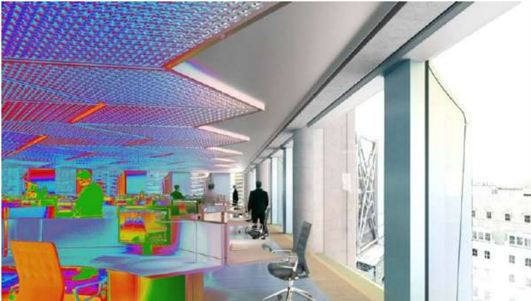
Figure 3: Analysis of light, heat, air, and sound movement through a building

Like Gehry and some of the other practices included in this article, the firm has developed software applications, in this case Hermes, an interoperability platform that facilitates the sharing of design data over a range of different applications and devices, and Sandbox, an interactive design tool. Other 4IR developments used by the firm include Machine Learning, Robotics, an Embodied Carbon viewer, 3D printing, and using algorithms in generative design (Shi, 2020: [s.p.]). In addition, the firm employs AI, Digital twinning, smart buildings, the internet of things, and collaborative design tools, including technologies such as virtual and augmented reality as part of the design process (Foster & Partners, [n.d.]).