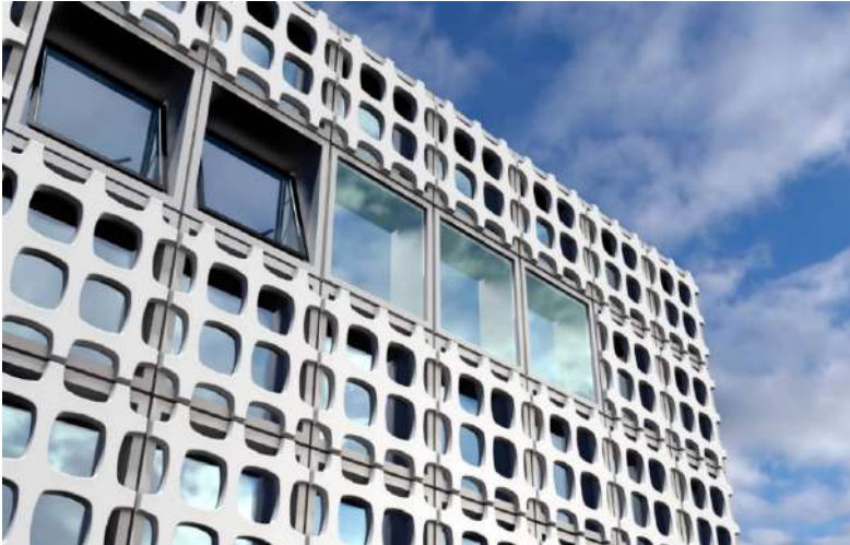
Figure 6: Winblok windows and screen