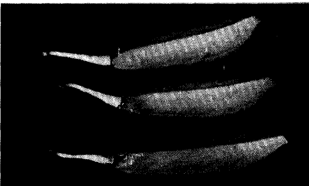
Plate 3. Pistils of Kazirakwe , a typical female fertile cultivar with short styles, normal size of the stigma and a small style base.