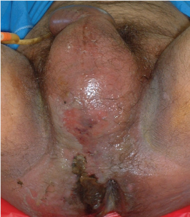
Figure 1 The scrotum is grossly swollen, erythematous with a small discharge from a blister. Note the ischiorectal abscess.