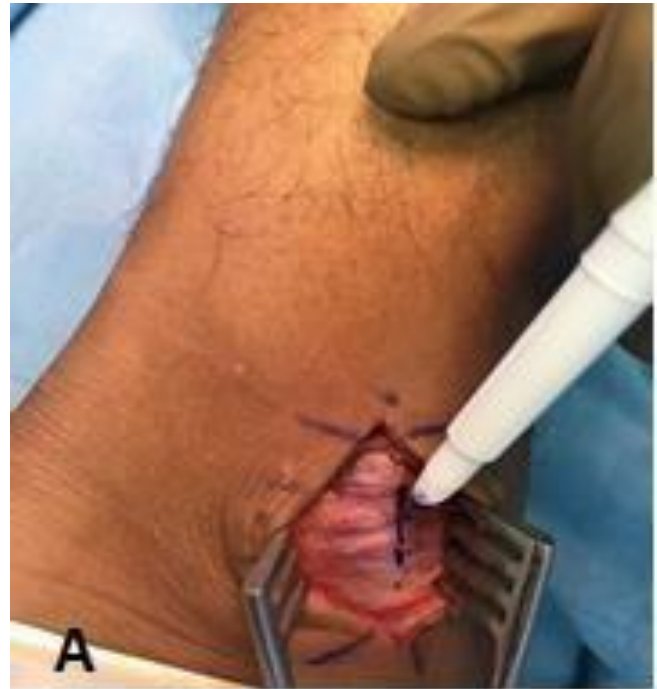
Figure A. Retinaculum intact superficially.

The procedure was performed under general anesthesia with a tourniquet used throughout. The patient was positioned in the left lateral position exposing the left medial malleolus. A curved incision was made posterior to the malleolus in line with the tibialis posterior tendon. Dissection was performed to the deep fascia to expose the retinaculum and malleolus. He had a type 2 dislocation with the retinaculum intact superficially (Figure A).