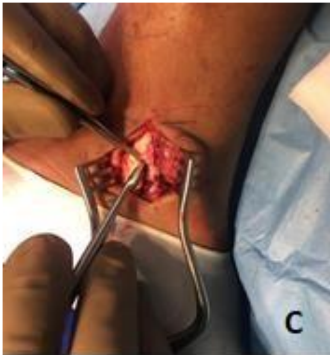
Figure C. Preparing retinaculum footprint.

tendon was easily reduced into its groove behind the medial malleolus (Figure B). The retinaculum footprint on the posterior aspect of the medial malleolus was prepared with a curette to create a raw surface suitable for healing (Figure C).