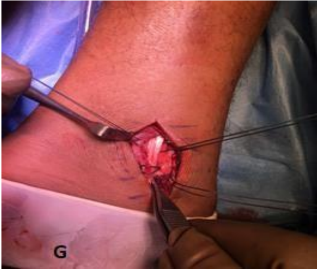
Figure G. Two Ethibond sutures, 1-cm apart, were locked into the retinaculum and shuttled through the tunnel.

in situ protected from accidental joint intrusion and ensured the tunnels to be connected. Two Ethibond sutures, 1-cm apart, were locked into the retinaculum. These sutures were then shuttled through the two bone tunnels from posterior and exiting medially (Figure G).