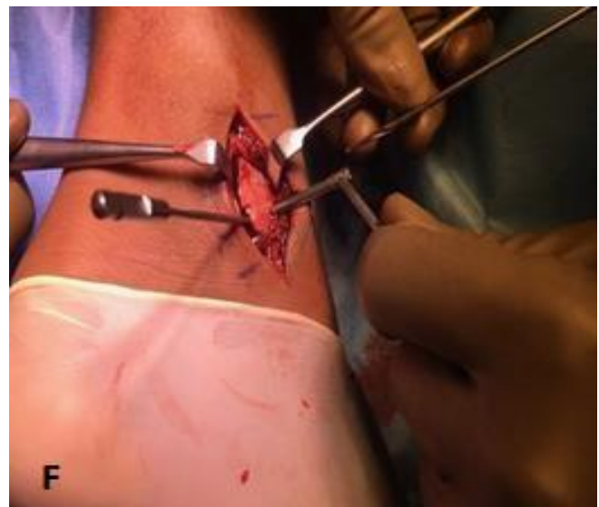
Figure F. Drill holes made in the malleolus from medial to lateral in the coronal plane.

These tunnels were 1-cm apart to create a bone bridge. Leaving a drill bit in each tunnel (Figure E), a connecting drill hole was made from the medial malleolar surface in a medial to lateral direction, aiming for the drill bit in situ (Figure F). The drill bit left in the