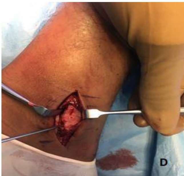
Figure D. Drill holes made in the malleolus from posterior to anterior in the sagittal plane.

Two 2-mm drill holes were made into the posterior surface of the malleolus from posterior to anterior in the sagittal plane, taking care to avoid accidental intra-articular intrusion (Figure D).