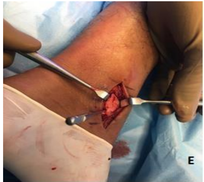
Figure E. Drill bits in situ.

Two 2-mm drill holes were made into the posterior surface of the malleolus from posterior to anterior in the sagittal plane, taking care to avoid accidental intra-articular intrusion (Figure D).