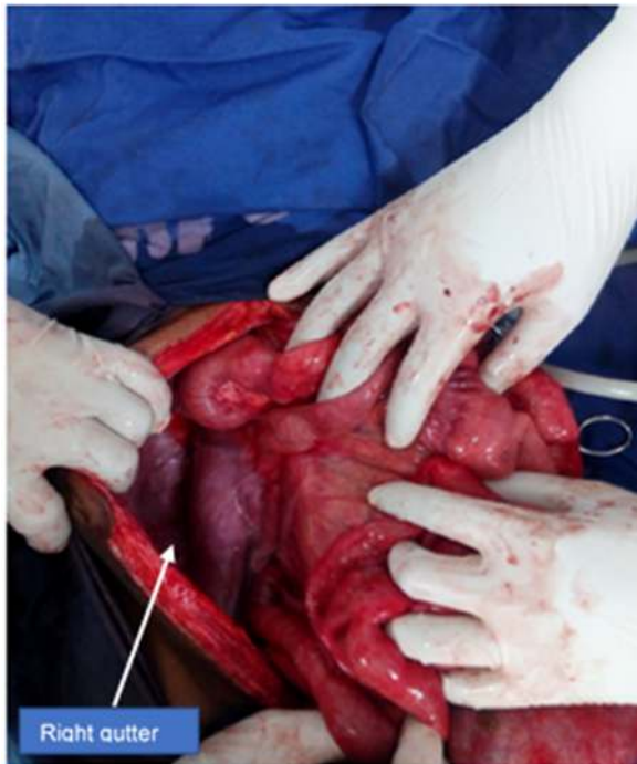
Figure 3. Cecum and ascending colon not fixed in the right gutter.