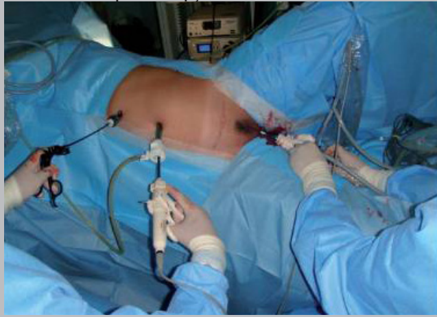
Figure 4 Hybrid NOTES combining trans-vaginal route with laparoscopy

This combination affords spatial orientation through camera vision (laparoscopically), instrument triangulation, tissue retraction and dissection (32). Nowadays a range of surgical procedures are carried out using a myriad of different entry points. For instance, the trans-vaginal nephrectomy with a peri-umbilical port for controlled visualization is termed the 'hybrid' transgastric-transvaginal nephrectomy (15,33). Using the transvesical route to access both thoracic and intraabdominal organs when the thoracoscope or umbilical ports are added is also possible (34-36). Porcine experiments on the feasibility of a transureteric 'hybrid' NOTES nephrectomy have also been documented by Baldwin et al (37).