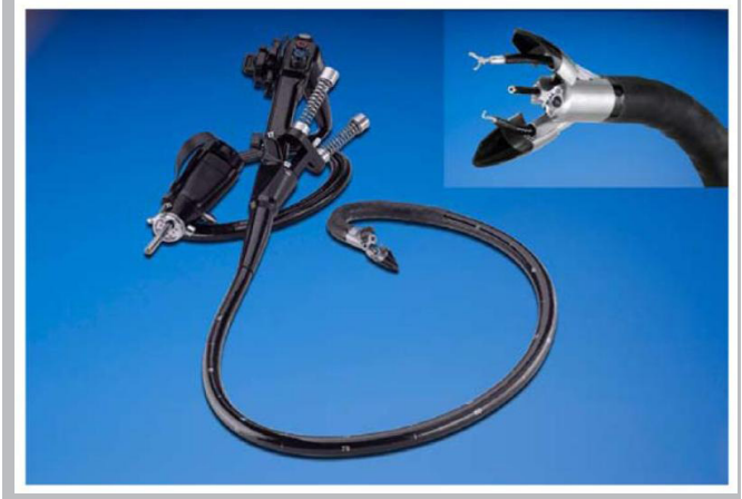
Figure 3: Endoscope used during NOTES

in a human being (23-25). Breda et al. retrieved a non-functional kidney through the vagina, while Gill and co-workers reported vaginal kidney extractions following laparoscopic nephrectomy with comparable morbidity to conventional port extraction (10,26,27).