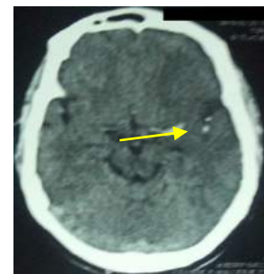
Figure 3. Spontaneous hyperdensity in the left sylvian valley in relation to fresh thrombus at the M1 segment of the left MCA.

Four patients (16%) and 4 others (16%) had diabetes and smoking as comorbidities, respectively. Neurological examination on admission found a disorder of consciousness and body hemiplegia in all patients; 14 or 56% of patients had an intracranial hypertension syndrome and 9 (36%) had pulsed oxygen saturation below 95%. The GCS score was \leq 8 in one patient (4%) and \geq 8 in 24 patients or 83.3% of cases. However, the mean NIHSS score was 17.5 with extremes of 15 and 20, and 96% of patients or 24 patients had a score between 16 - 20 on admission. After 3 days of hospitalization, 11 patients or 44% had a GCS of 3 - 8; 12 patients or 48% had a GCS of 9 - 14 and only 2 patients or 8% had a GCS of 15. In addition, 72 % of our patients had an NIHSS score above 17 versus 28 % with an NIHSS score below 17. The cerebral CT found a right MSI with ipsilateral ventricular mass effect in 14 (56%) of the patients versus a left MSI with ipsilateral ventricular mass effect (Figures 2 and 3) in 11 (44%) (figures 4 and 5).