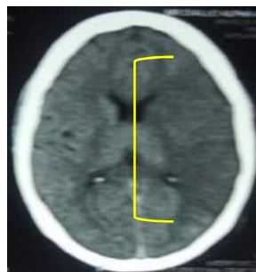
Figure 2. Brain scan without injection of contrast agent in axial section revealed a subacute hypodensity of the superficial and deep areas of the left MCA with a discrete mass effect on the ipsilateral ventricle.

The mean age of the patients was 59.12 \pm 17.70 years, and they were divided into age groups with a range of 15 years, with extremes of 29 - 94 years. There was a strong predominance of females (sex ratio =0.92); 100% of the patients consulted for altered consciousness, aphasia, 56 % for left hemiplegia, altered consciousness, aphasia and 44% for right hemiplegia, altered consciousness plus aphasia. The mean time of admission in hours was 77.1 \pm 73.8 h with extremes of 7 h and 360 h, 72 % of patients were admitted beyond 48 hours and only 20% within the first 24 hours (figure 1).