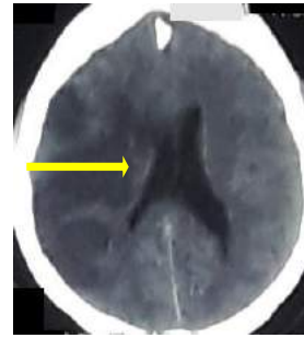
Figure 5. Mass effect on the ipsilateral lateral ventricle.

Cerebral edema was found in 23 (92%), mass effect on median structures in 20 (80%) and cerebral involvement in 12 (48%) (table 1).