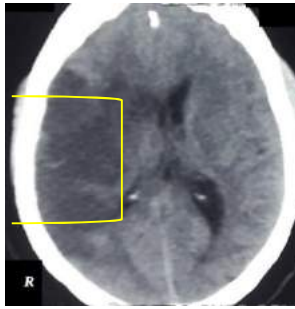
Figure 4. Cerebral scanner without injection of contrast agent in axial section revealed a hypodensity of the superficial and deep territories of the right MCA