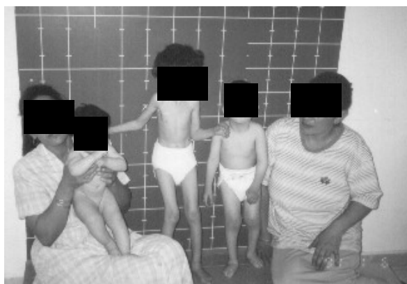
Figure 2: The Family [From the right to the left; III 3 is the mother of the proband, next the proband (IV 2). Next, the female cousin, with the full clinical criteria of Cockayne syndrome, (IV 3), Next the female offspring IV 4 with clinical features mimicking COFS syndrome]