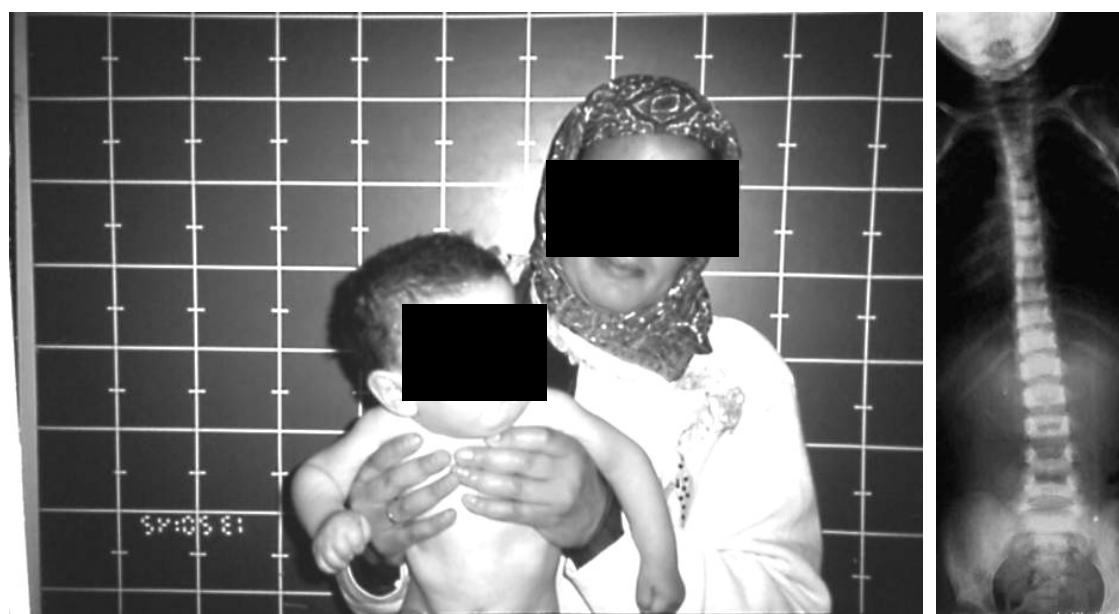
Figure 3: The proband and his mother (IV 2) and (III 3); antero-posterior X-ray view (note the osteosclerotic bone changes in a descending manner and discrete dorsal scoliosis)