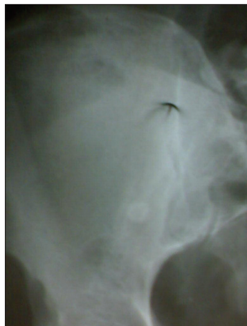
Figure 1: Abdominal x-ray showing a radio-opaque shadow in the right iliac fossa consistent with an appendicular fecalith

At operation, the findings were a markedly inflamed appendix with involvement of the wall of the cecum. The appendix was perforated at the base with contamination of the peritoneum over a wide