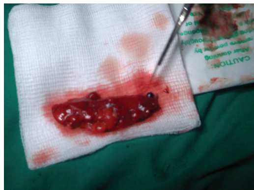
Figure 3: Photograph of the operative specimen with the scalpel pointing to the fecalith protruding from the lumen of the appendix