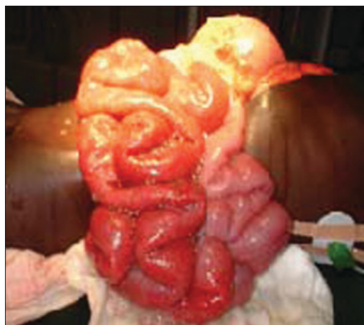
Figure 2: An 8-year-old boy who fell from an orange tree in an attempt to harvest oranges with a sickle. The sickle cut him from the chest wall to the abdominal wall. The right lung was collapsed and all the intestines protruded out of the wound as seen here

Abdominal trauma was diagnosed in 45 children, of whom 32 were blunt and 13 were penetrating. In the group with blunt abdominal trauma, the spleen was the major cause of hemoperitoneum, requiring a laparotomy in 22 children. Those with penetrating abdominal injury had obtained such injuries from accidental gunshot wounds (3); falls from heights with objects penetrating them through the perineum into the abdominal cavity (2); deep