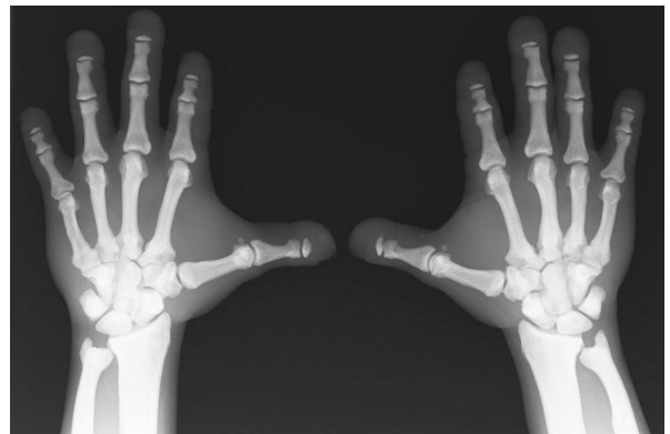
Fig. 2. AP X-ray of both hands demonstrate short stubby fingers with dysplastic nails and acro-osteolysis.