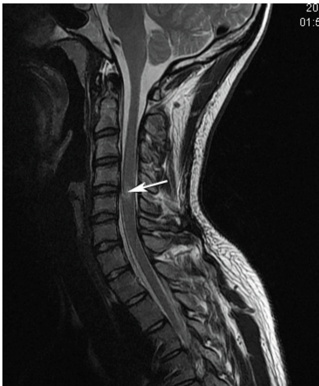
Fig. 1. Sagittal T2-weighted MRI of cervical spine demonstrates spinal cord hyperintensity at C4 and C5 levels.

A 34-year-old man presented with a history of a stab wound to the left side of the neck. Physical examination revealed an ipsilateral left-sided hemiplegia and contralateral loss of sensation. A clinical diagnosis of Brown-Sequard syndrome was made. Magnetic resonance imaging (MRI) findings demonstrated hyperintensity at C4 and C5 levels on sagittal T2-weighted sequence of the cervical spine (Fig. 1) with limitation to the left hemicord demonstrated in the axial plane (Fig. 2), accounting for the Brown-Sequard syndrome. The patient was managed with supportive treatment.