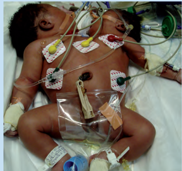
Fig 2. Day 2 post delivery photograph showing the larger twin A on the left, smaller twin B on the right, 2 heads, 2 necks, extra-large conjoined thorax, 2 sets of upper limbs, single female genitalia, and single set of lower limbs

a: brain of twin A demonstrating mature grey-white matter differentiation b: twin B on the right in a sagittal position looking at twin A c: the complex multi-chambered heart d: stomach of twin A e: horseshoe kidney f: high signal in the pelvis due to a single full bladder.