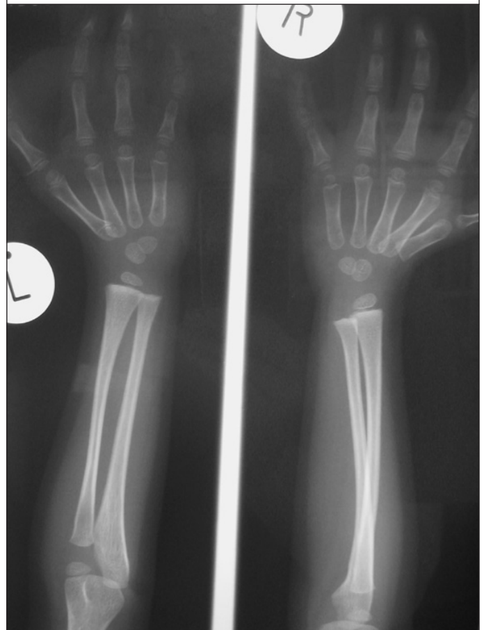
Figure 2: Radiograph of her forearms showing absent left thumb and radial hypoplasia.

She has a 7-year old sister with similar upper limb abnormalities who had been diagnosed with Fanconi's Anaemia. No other family members were affected. A provisional diag-