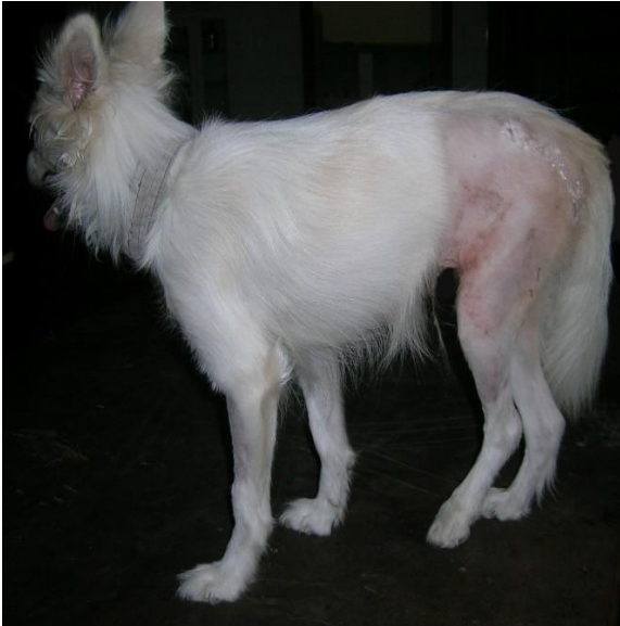
Figure 5. Animal 20 days post-operatively with weight bearing.

intramuscularly after being premedicated with atropine sulphate at 0.04mg/kg b.wt subcutaneously. The maintenance of anaesthesia was carried out with ketamine hydrochloride. The dog was positioned in lateral recumbency and incision was made from the cranial extent of the iliac crest to adjacent to the caudal border of the greater trochanter concurrent with the lateral approaches to ilium as described by Johnson and Dunning (2007). Contrary to this pelvis is also approachable through dorsal midline incision in sternal position as described by Olmstead (1995). The ilial wing was approached by incising and reflecting the tensor fasciae lata and middle gluteal muscle whereas, ischium was exposed by reflecting the biceps femoris muscle caudally to expose the sciatic nerve. The dynamic compression plate was attached to the caudal segment first with bone screw. The alignment