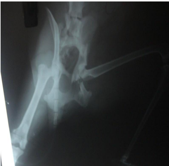
Figure 2. Ventrodorsal radiograph of pelvis demonstrates unilateral fracture of