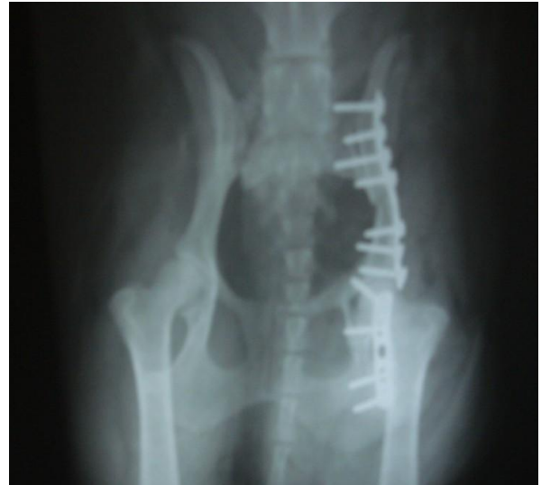
Figure 4. Radiograph (V.D. view) of pelvis after fixation.