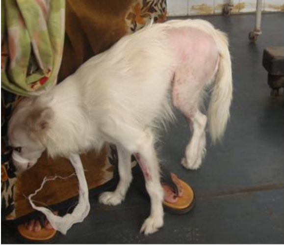
Figure 1. Animal before operation with inability to bear weight and appear to be shorten.

The bitch was anaesthetized with xylazine Hcl at 1mg/kg body weight (b.wt) and ketamine Hcl at 5 mg/kg b.wt