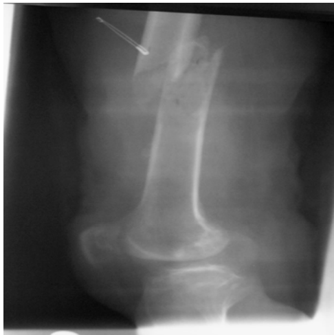
Fig iii Rt. femoral pathological fracture

The mass in the left thigh had increased tremendously in size. On clinical examination, the mass was firm and tender, not