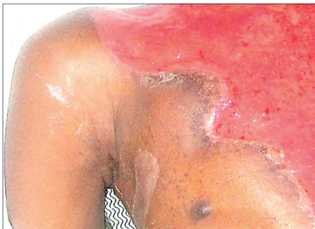
Figure 1: Wound edges become light pink in color and start to slope inwards toward the wound

Patients were also screened for background compromising systemic conditions which were attended to when present in conjunction with appropriate specialties within our hospital. Other supportive therapy including adequate nutritional build up was also carried out for the patients.