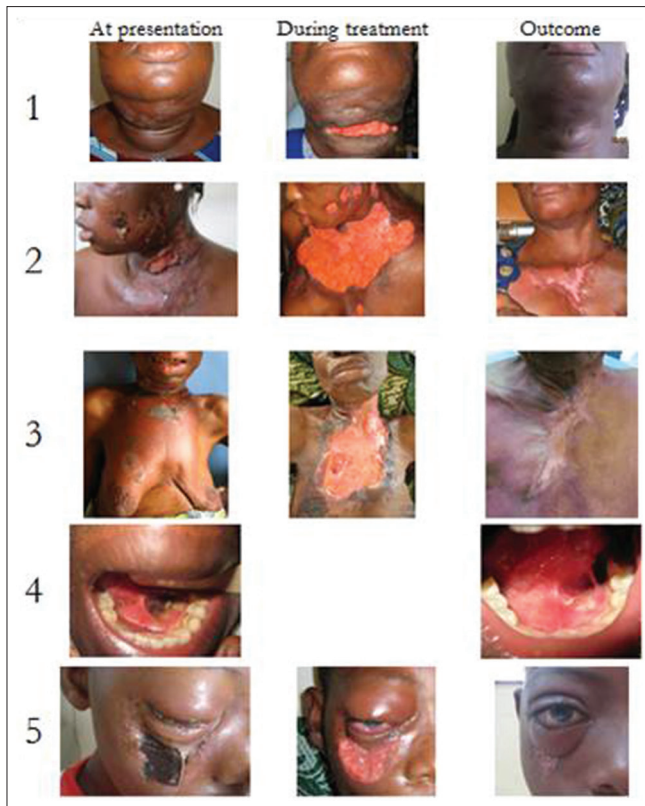
Figure 3: Pictures of some of the cases in this study

less common in the maxillofacial region possibly due to the rich blood supply to this region. [3,7,8,10] Necrotizing fasciitis involving the mucosal lining appears to be very rare. In fact, CNF was described as an infection that spares mucous membrane in previous literature. [11] However, three cases in our study occurred intra-orally with involvement of mucous membrane [Table 1] and the one that involved the floor of the mouth is shown as case 4 of Figure 3.