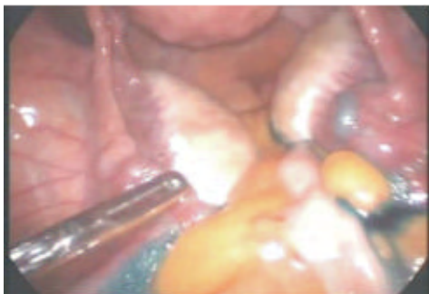
Figure 2: Dye Test (Methylene blue) +ve Spillage.