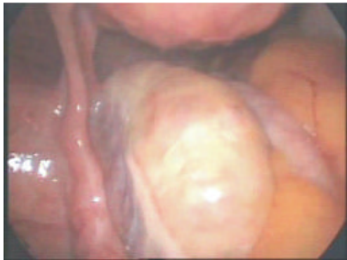
Figure 2: Dye Test (Methylene blue) +ve Spillage.