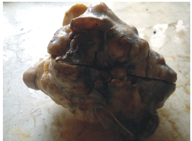
FIG 1. GIANT BRENNER TUMOUR

She was again counselled on the condition, re-assured and discharged from the gynaecology clinic.