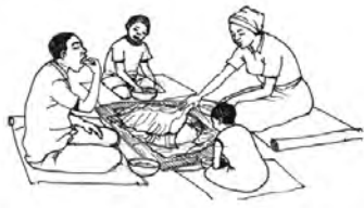
(o)lwo [(o)lwó] y. [(o)lu- + o] bl: [Lg: olwo] Oluvainhuma oba olunaamala? gez: Buti olwo?