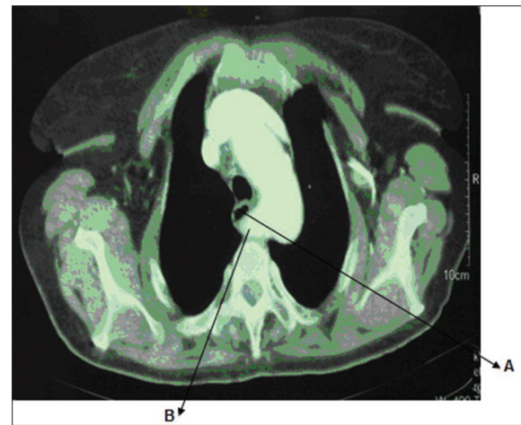
Figure 1: Computed tomography scan of aberrant right subclavian artery (B) posterior to esophagus (A)

However in patients who are candidate for upper mediastinal interventions such as esophagectomy (especially the transhiatal esophagectomy), even the asymptomatic cases of this arterial anomaly become challenging.