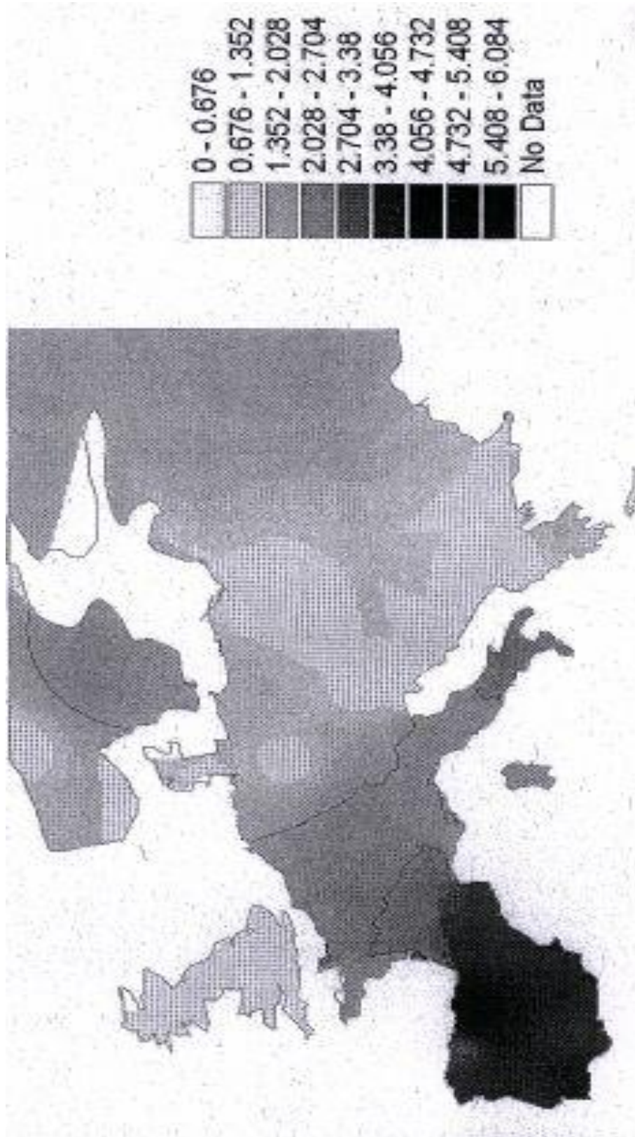
Figure 2. European distribution of the G2019S frequencies. The various nuances of grey correspond to artificial discontinuities, with density percentages as indicated.