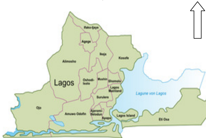
Figure 1: Map of Metropolitan Lagos. Source: Lagos State Ministry of Information

Deductions from the result of the 2006 population census, indicates that Lagos state is believed to be the most populous state in Nigerian after Kano with a population of over 9 million people even though the result was refuted by the then Lagos State Governor who conducted a separate census exercise for the state resulting to a population about 14 million people (Sandra Yin, 2007).