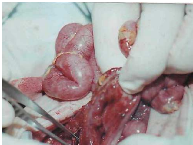
The perforated sigmoid.