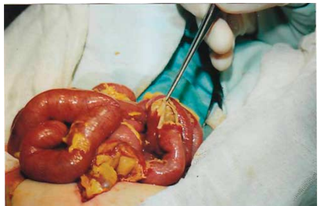
Multiple ileal perforations.

patients with features of peritonitis, 28 were managed with flank drains alone, whereas four underwent laparotomy and two were managed conservatively.