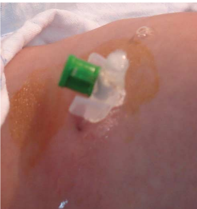
Air and clear serous fluid coming out spontaneously through the cannula.