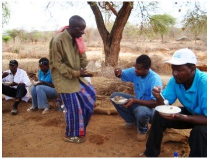
Figure 4: A happy farmer sharing a meal he prepared for team 3 in Tseikuru

Community ownership of the project was manifested when two of the stolen mineral blocks were traced brought back by community members, who took it upon themselves to investigate and identify the culprits.