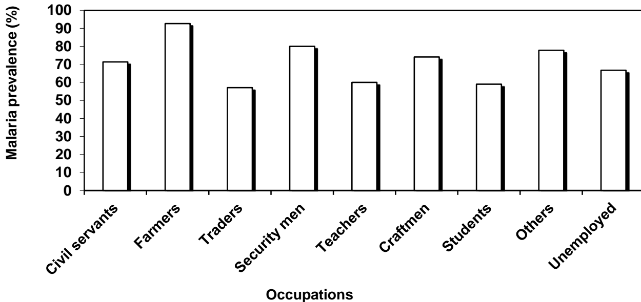
Figure 3: Bar Chart showing malaria prevalence with respect to occupation of the participants.

Note: Others include welders, mechanics and bicycle repairers, clergy, fishermen, shopkeepers, apprentices, mason, carpenter, plumbers and blacksmiths.