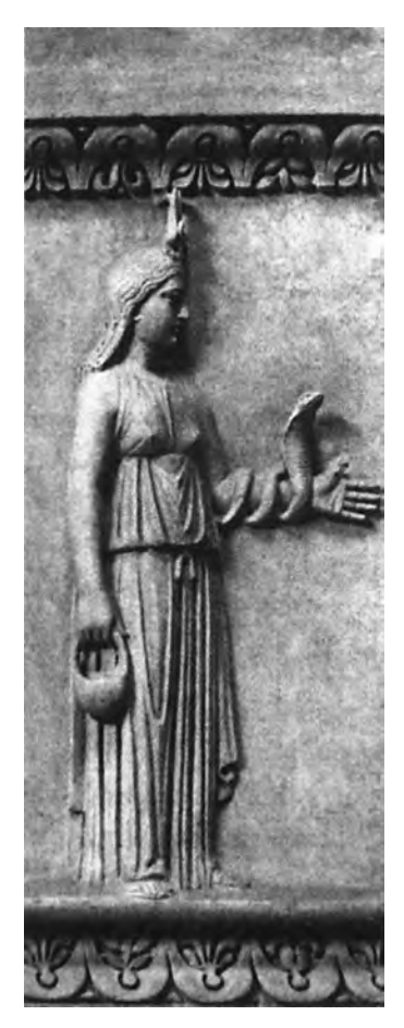
Figure 13: A priestess of Isis, dressed as the goddess with a cobra around her left arm.

Rome. An image of Cleopatra was displayed in the procession, wearing the robes of Isis and with the goddess's traditional armlet (a coiled snake) on her forearm (Fig. 13). Roman spectators ignorant of Egyptian religious symbolism might have interpreted this as suggesting that her death had been caused by a snake — in fact, three Roman poets