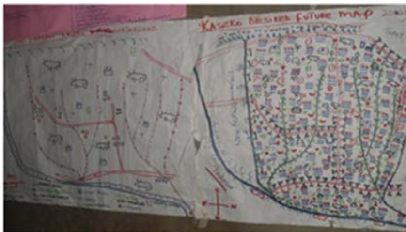
Figure 2. Community vision/ future map for Kaseko watershed landscape.

Conflicts and conflict management. The iterative process of planning proved to be an important aspect of IPs as specific interests of all members who were incorporated into the IP action plans and, thus implemented as desired by the IPs. This was vital to gain interest and ownership of the process, which is an important factor for successful technology adoption as Vanclay, 2004 argues that scaling up, like extension, is not just about technology transfer but a critical understanding of the needs and visions of farmers. In this study, the interests of different stakeholders were reflected both positively and negatively, which triggered some conflicts. The conflicts were associated with the inputs availed to facilitate the IP activities and the financial facilitation to enable IPs plan. There were also conflicts pertaining to collective action where some members refused to participate. These conflicts were solved by the rules set by the members. These rules involved denying the